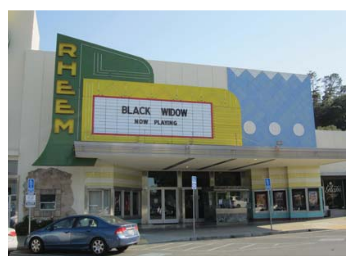
The Rheem Theatre greets patrons once again